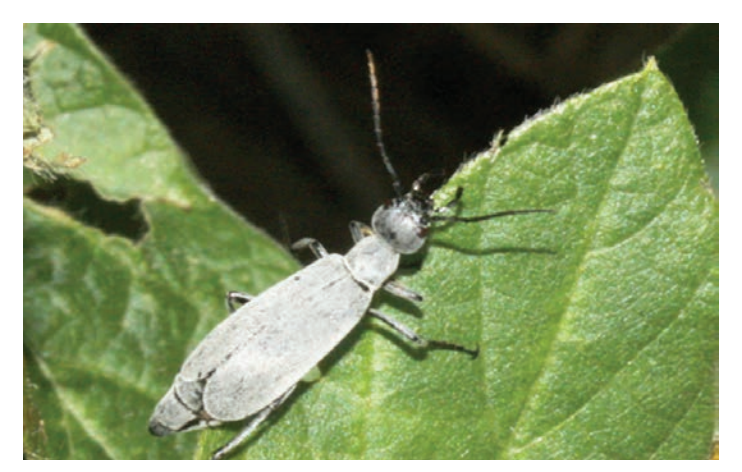
Figure 1. Ashgray blister beetle.

tible to blister beetle poisoning (cantharidiasis). Blister beetles can be crushed and killed as alfalfa is swathed. When hay is baled, bodies of dead beetles, which still contain cantharidin, may be incorporated into bales. Contamination may not be visible if beetles are crushed during haymaking. Once contaminated, hay does not lose toxicity. Cantharidin does not break down when heated or dried.