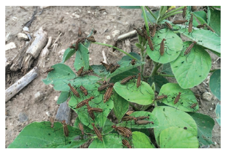
Figure 3. Aggregation of striped blister beetles on soybeans.

Striped blister beetles may be present in Kansas alfalfa fields from mid-June through mid-September with peak populations typically occurring from the end of June through the end of July. Overall, second through fourth cuttings present a greater risk than other cuttings. The first, peak, and last appearance of blister beetle species known to occur in Kansas alfalfa are shown in Figure 4. Nationwide, blister beetles occur throughout all alfalfa growing regions. Species composition, seasonal occurrence, and abundance vary widely among geographic production regions.