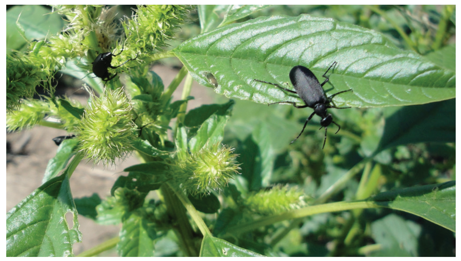
Figure 2. Black blister beetles on the weedy margin of a field. Blister beetles are strongly attracted to pollinating weeds.