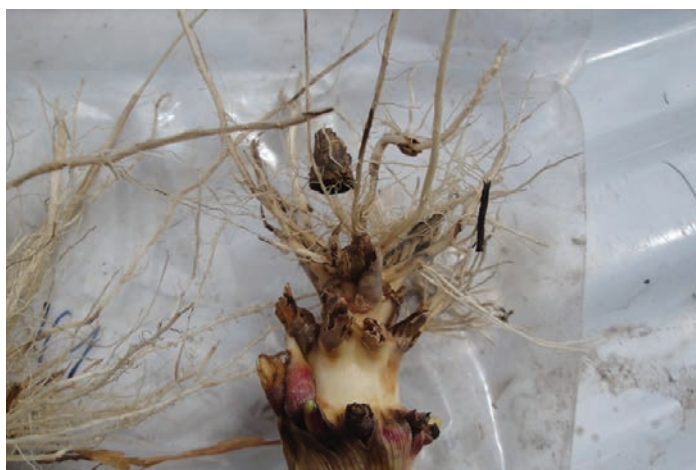
Figure 7. Severe CRW larval feeding damage.

Rootworm insecticides or resistant hybrids are not recommended when corn is planted in rotation. Volunteer corn in non-corn fields should not extend rootworm larval problems into the following year unless plants persist throughout the mid-July through September egg-laying period at a density of more than 4,000 corn plants per acre. In some states in the upper Midwest, corn rootworms survive in a non-corn crop by remaining in the egg stage (diapausing) for two winters before hatching. This phenomenon has not yet been confirmed in Kansas.