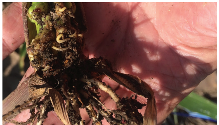
Figure 4. Corn rootworm larvae feeding in corn root.