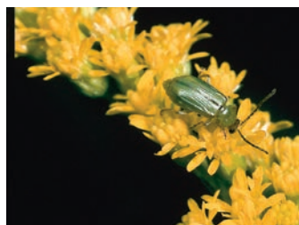
Figure 2. Northern corn rootworm