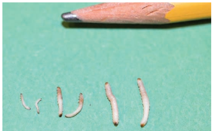
Figure 5. Corn rootworm larvae early instar (left) to mature instar (right)