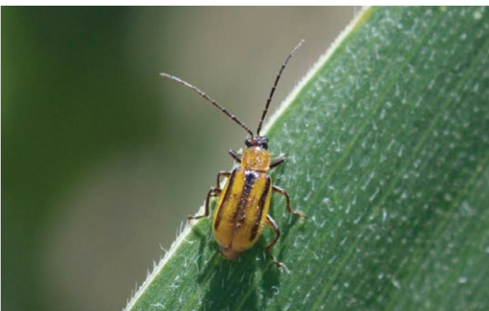
Figure 3. Western corn rootworm