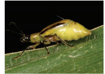
Figure 9. Gravid female

Scout fields weekly from the time beetles first emerge until they stop laying eggs (July–September). If beetle counts reach the 0.5/ear zone (5 beetles/10 plants) and 10 percent of the female rootworms are swollen with eggs (gravid) (Figure 9), make a spray application immediately. The ear zone includes the area bracketed by the lower surface of the leaf above the ear, down to and including the upper surface of the ear leaf below the ear. Counts should only include northern and western corn rootworms.