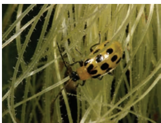
Figure 1. Southern corn rootworm

Northern and western rootworm larvae tunnel into corn roots, pruning as they feed (Figures 6 and 7). Damage limits uptake of soil nutrients and greatly reduces stress tolerance. Under favorable conditions, plants can regenerate roots with minimal yield loss, but under prolonged poor environmental conditions, losses can be severe. Significant rootworm feeding followed by strong winds can flatten (lodge) plants and reduce their ability to harvest sunlight. Corn typically rights itself, but some plants may be goose-