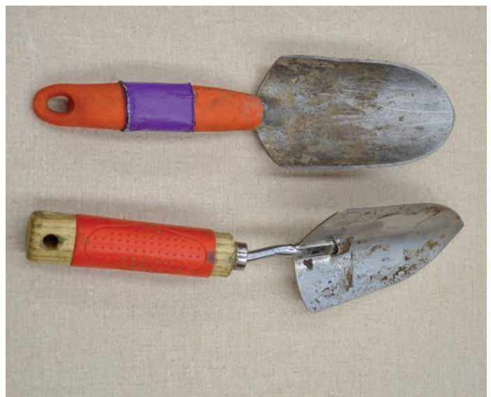
Figure 7: The tool on bottom has a tang and ferrule connection with a stamped head. The tool on top with a forged head and solid shank is stronger.