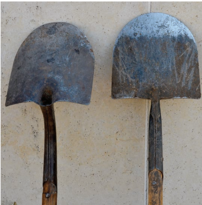
Figure 6: Heads can be joined to the handle in different ways. The open-back tool on the left is weaker than the tool on the right, which has a closed back and forged head. The tool on the right is strong and well-made, but more expensive.