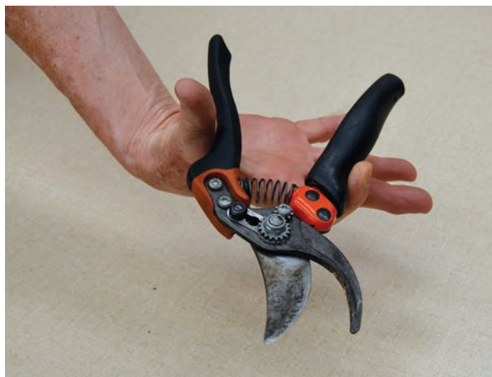
Figure 2: This tool is too large. It causes the hand to extend too far to make a cut. This can lead to hand fatigue and injury.