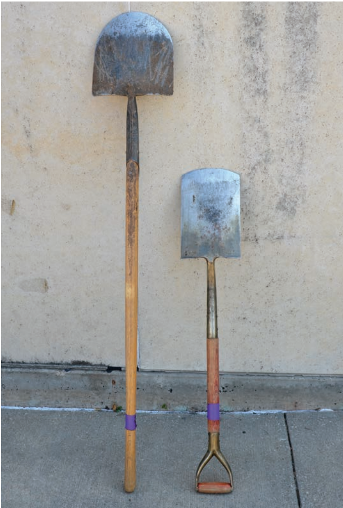
Figure 3. The shovel on the left is best for digging. The spade on the right is ideal for edging and features a D-shaped grip for leverage.

In shopping for tools, you may come across fiberglass, steel, or aluminum handles. Fiberglass handles are stronger than wood handles, but they transfer vibrations through