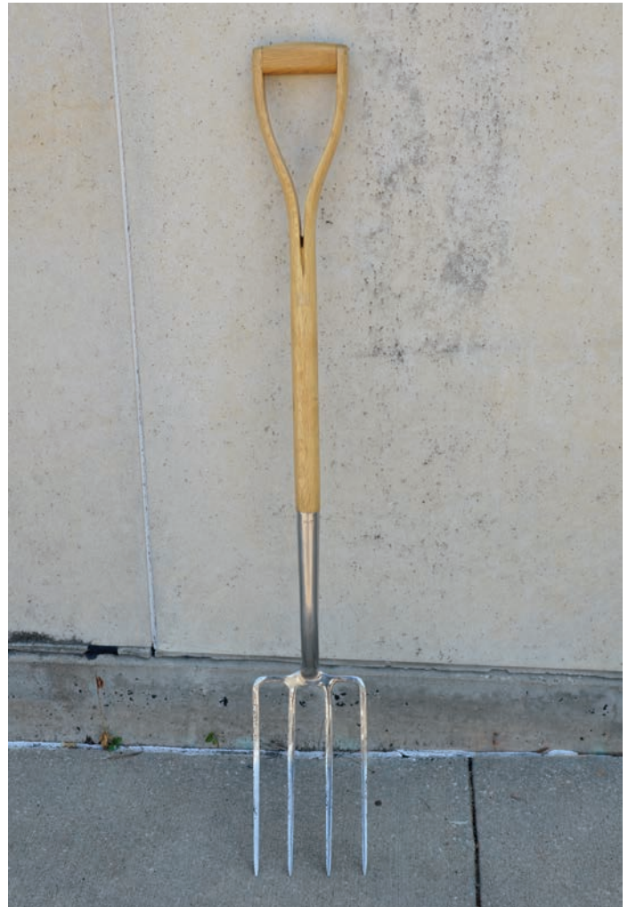
Figure 4: A high-quality stainless steel digging fork with a secure head-to-handle connection and a YD grip. This handle converges into a Y and is slightly different than the D-grip handle shown in Figure 3.