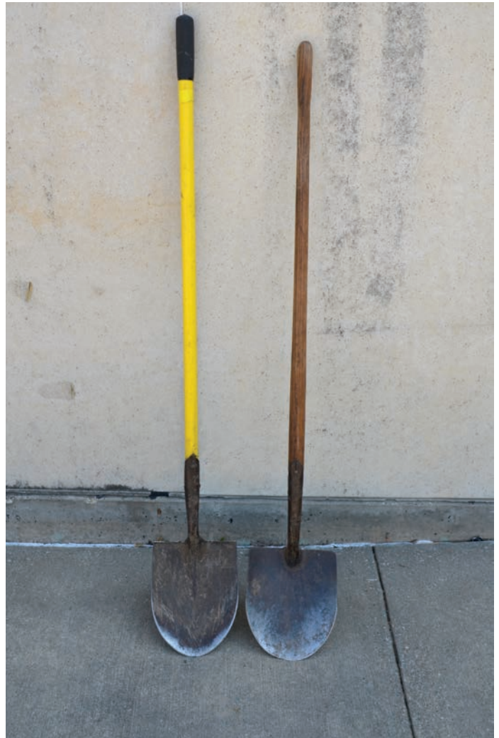
Figure 5. Shovels come in various lengths and materials. The shovel handle on the left is made of fiberglass.

Less expensive tools may have a two-piece head referred to as tang and ferrule (Figure 7). The tang fits into the hole of the handle, which is sheathed in a metal casing or ferrule. This type of construction is common in small hand tools. High-quality tools have a closed socket or solid, shank-type construction that prevents dirt, debris, and moisture from entering the socket.