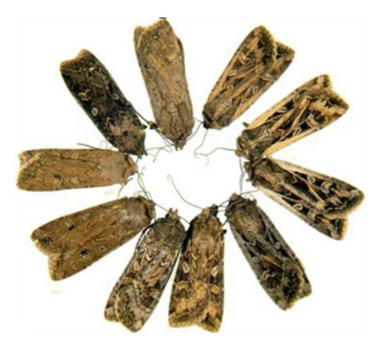
Figure 3. Moths

Army cutworm moths vary in coloration and wing pattern (Figure 3). Male and female moths can be differentiated based on overall shading – females are predominately grey, and males tend to be brownish. Larvae also vary in