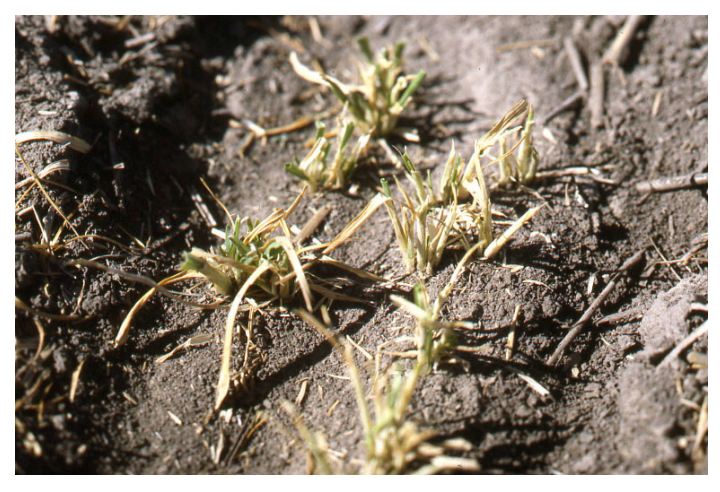
Figure 6. Wheat plants browsed by army cutworms

In wheat, larvae restrict feeding to the tender blades, tending to avoid the stems and crown or meristematic tissues that make regrowth possible (Figure 7). After larvae have exhausted local food supplies, they may form an 'army' and move en-masse in search of other host plants. Fortunately, once larvae either pupate or move on, affected wheat plants generally recover, although yields may be reduced if defoliation was severe.