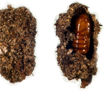
Figure 5. Pupation