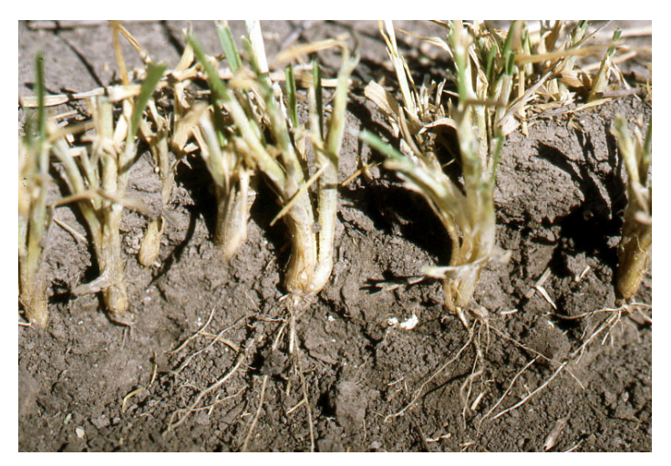
Figure 7. Damaged wheat resprouting