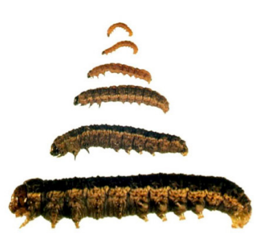
Figure 4. Larval development