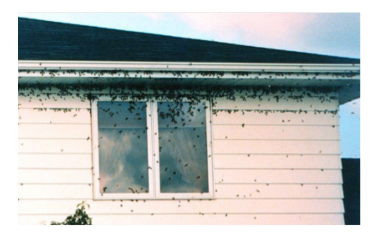
Figure 8. Swarm of migrant moths

When larvae finish feeding – usually in late April or early May – most larvae burrow into the soil and disappear, seemingly overnight. Each larva creates an earthen cell and spins a cocoon in which to pupate. Within two to three weeks, 'miller moths' emerge, often in vast numbers, with potential to create a significant urban nuisance. Their mere presence can be disconcerting. To avoid daylight, moths seek shelter in cracks and crevices, such as doors to commercial buildings, homes, garages, sheds, outbuildings, and vehicles. A flurry of moths darting out of hedges and bushes may startle people on a morning stroll. Additionally, dislodged wing scales create 'dust' that may cause skin and eye irritation in allergic people. Within homes, shed scales and spots of excrement may require significant cleaning effort. Turning off porch lights at night and replacing white lights with yellow can help reduce the number of moths attracted to a residence (Figure 8). There is no point trying to kill moth swarms outdoors as they make their way west. Others will replace them the next evening until the migration subsides.