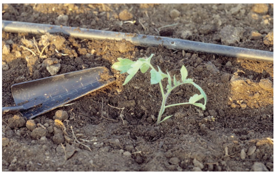
Set tomato plants mostly below the soil surface and cover to the first set of leaves.

Ask your local extension agent for specific recommendations on fertilizing tomatoes. If you choose not to do a