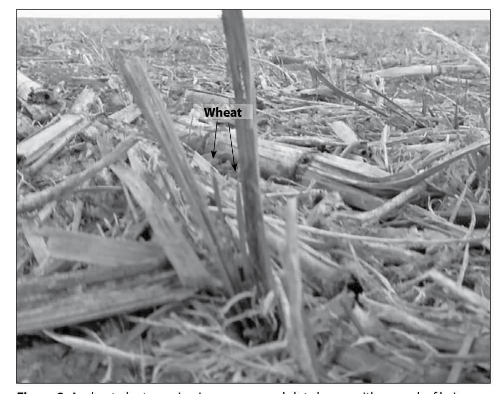
Figure 2. A wheat plant growing in an open seed slot closure with a corn leaf hair-pinned underneath it.