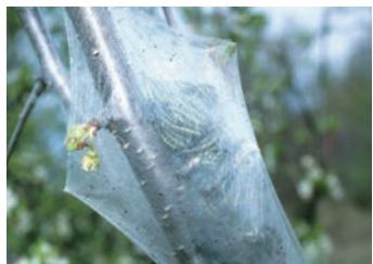
Figure 3. Larvae cluster