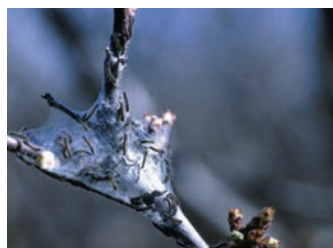
Figure 2. Nest