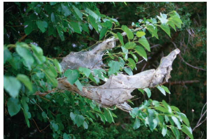
Figure 18. Minimal webbing