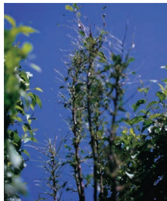
Figure 9. Defoliated tree