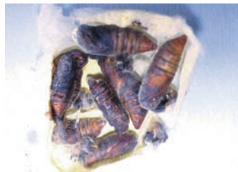
Figure 7. Larvae cluster