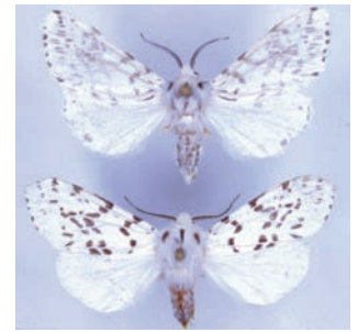
Figure 15. Moth (spotted)