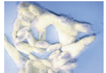
Figure 6. Silken cocoons