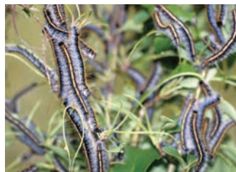
Figure 4. Larvae on foliage