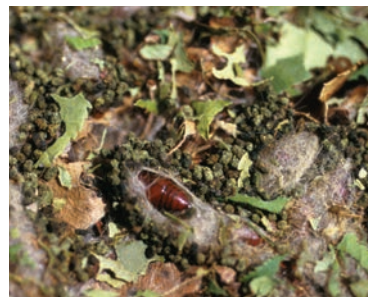
Figure 14. Overwintering pupa

Hosts. Fall webworms feed on a variety of deciduous species. The table below lists hosts recorded in a survey of infested trees in the area around Manhattan, Kansas. Although each of the webworm races shows definite host preferences, some hosts appear equally acceptable to both races.