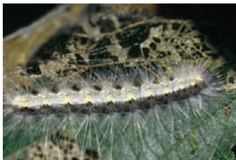
Figure 11. Blackheaded larva

Seasonal life history. In Kansas, four generations of fall webworms occur per year, two for each race. Initial generations for each race are staggered and distinct (Figure 13). As the season progresses and moth activities overlap, it becomes difficult