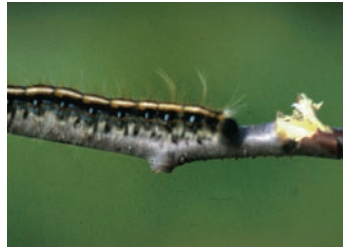
Figure 5. Mature larva

Hosts. Eastern tent caterpillars have a wide host range but are usually associated with native plant species in the genus Prunus (sandhill plum and chokecherry) and ornamental and orchard trees in the genus Malus (flowering crab and apple).