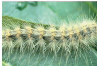
Figure 12. Redheaded larva

to distinguish one generation from another. Fall webworms overwinter as pupae (OWP) in loose, silken cocoons beneath soil debris or just beneath the soil surface (Figure 14).