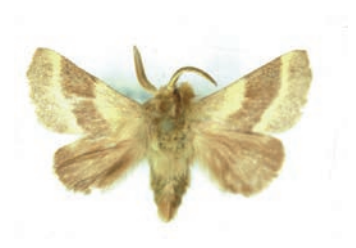
Figure 8. Moth

Damage. Eastern tent caterpillar infestations in wild trees do not capture much attention, but feeding on landscapes and orchards raises concern. Caterpillar feeding stops by mid May as foliage begins to grow rapidly. Defoliated trees and branches (Figure 9) produce a flush of new growth in less than three weeks (Figure 10), restoring their appearance.