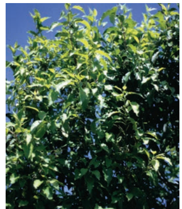
Figure 10. Regrowth