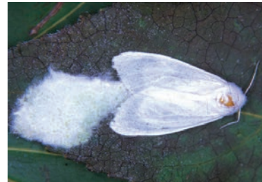
Figure 16. Moth (white form)