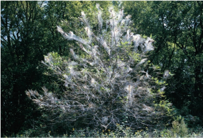
Figure 19. Extensive webbing