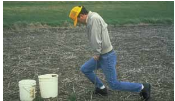
One of the most critical, yet least used, Best Management Practice in nitrogen management is the profile nitrogen soil test.

As the nitrogen cycle demonstrates, there is no way to prevent a portion of the nitrogen in the soil from being converted into nitrate. This is true even if all nitrogen is applied as organic nitrogen or ammonium. Producers can, however, minimize the amount of nitrate in the soil at any given time. The chart on the opposite side of this brochure lists some of the BMPs available for nitrogen management.