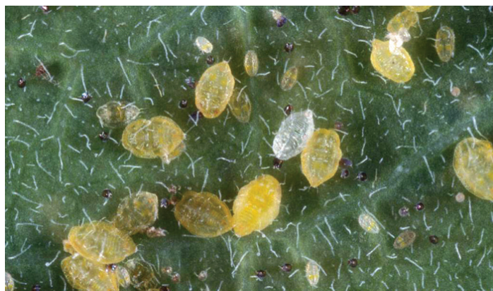
Figure 4. Sweetpotato whitefly pupae.