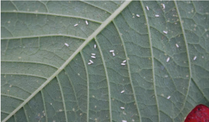
Figure 6. All whitefly life stages (eggs, nymphs, pupae, and adults) are located on leaf undersides.