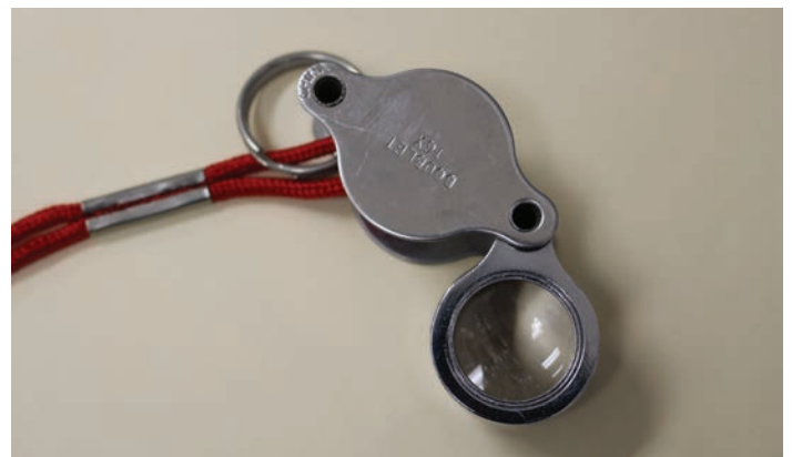
Figure 13. A 16x hand lens should be used to inspect plants for whiteflies.