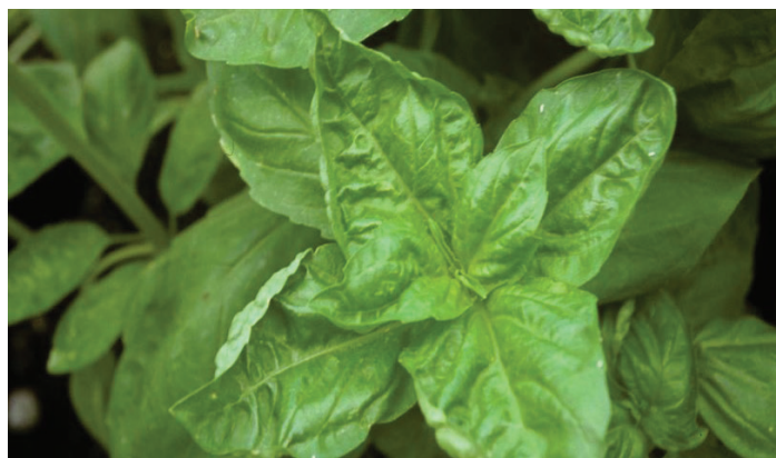
Figure 10. Leaf distortion on basil plant associated with whitefly feeding.

Whiteflies can damage ornamental and vegetable crops indirectly by transmitting plant pathogens such as viruses. The sweetpotato whitefly can transmit several viruses to ornamentals and vegetables including Ageratum yellow vein virus , Cucurbit leaf curl virus , Rose leaf curl virus , Squash leaf curl virus , and Tomato yellow leaf curl virus . The greenhouse whitefly also transmits several viruses such as Abutilon yellows virus , Sweet potato chlorotic stunt virus , and Tomato yellow leaf curl virus . There is no cure for a virus. Consequently, infected plants should be disposed of immediately to prevent further spread of the virus.