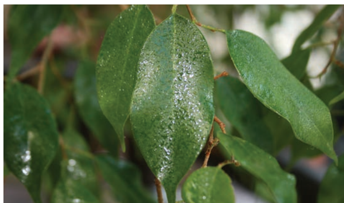
Figure 11. Honeydew on plant leaf.