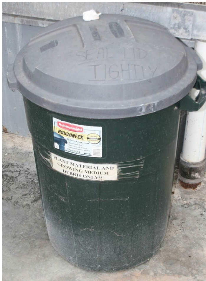
Figure 16. Garbage container with tight-sealing lid.

Whiteflies may be present in greenhouses throughout the growing season, especially when weeds are allowed to grow underneath benches (Figure 17). Weeds such as annual sow thistle ( Sonchus oleraceus ), common chickweed