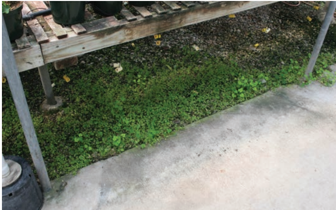
Figure 17. Weeds underneath bench may be a reservoir for whiteflies.

Screens must be cleaned regularly during the growing season to remove debris that can restrict airflow. Clean screens from the inside of the greenhouse using a hose and low-pressure nozzle. Avoid using high-pressure cleaners or brushes that can expand the size of the holes and affect the functionality of the screening. Do not clean screens while