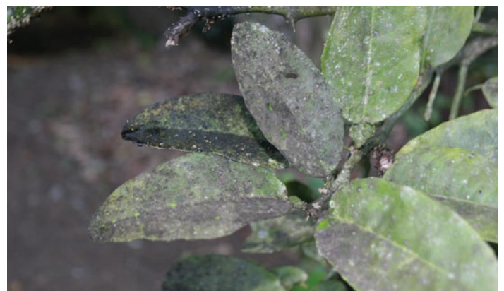
Figure 12. Black sooty mold on leaf.

Plant material received from suppliers should be isolated in a separate area of the greenhouse operation for approximately two weeks before introducing plants into the main production greenhouse. Plants should be inspected regularly for eggs, nymphs, pupae, and adults using a 10 or 16x hand lens (Figure 13). Once plants have been determined to be “whitefly free,” they can be moved into the main greenhouses and placed among the other plant material.