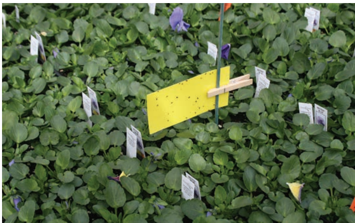
Figure 14. Yellow sticky card placed above the crop canopy.

Plants should be inspected at least twice a week during the growing season (Figure 15). Use a 10 or 16x hand lens to inspect the undersides of old (mature) and young (new) leaves for the presence of eggs, nymphs, and/or pupae. This is especially important for crops highly susceptible to whiteflies including basil, eggplant, fuchsia, hibiscus, lantana, poinsettia, salvia, tomato, and transvaal daisy.