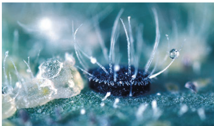
Figure 2. Greenhouse whitefly pupa