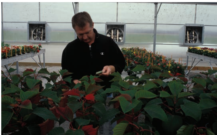
Figure 15. Inspecting plants for the presence of whitefly eggs, nymphs, or pupae.