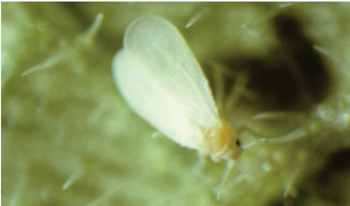
Figure 5. Whitefly adult.

Whitefly adults are \frac{1}{13} to \frac{1}{9} inches (2 to 3 mm) long, depending on the species, with white to yellow bodies and four wings covered with a white, waxy powder (Figure 5). Adults disperse short distances when plant leaves are disturbed. All life stages (eggs, nymphs, pupae, and adults) are located on the undersides of young and mature leaves (Figures 6 and 7). Adult females lay up to 20 eggs per day, which are arranged in a crescent-shaped pattern on the underside of leaves. Females can lay up to 200 eggs during their 30- to 45-day lifespan. Female longevity and the number of eggs laid are dependent on temperature and