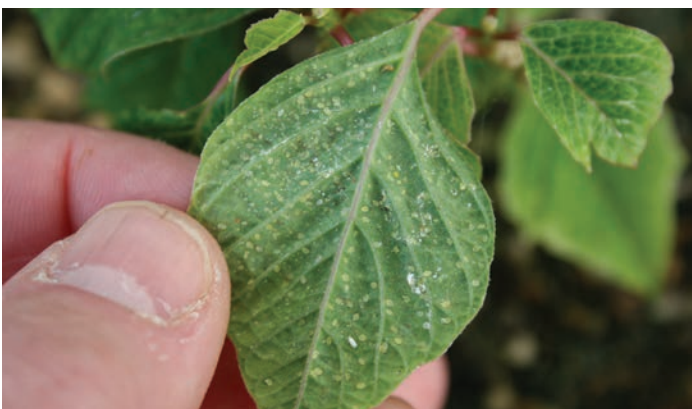
Figure 7. All whitefly life stages (eggs, nymphs, pupae, and adults) are located on leaf undersides.

host plant quality. Eggs are attached upright on the leaf surface by means of a thin stalk. Greenhouse whitefly eggs are green to purple, whereas sweetpotato whitefly eggs are white to yellow-brown with a darkened tip.