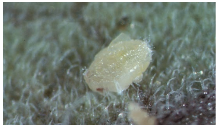
Figure 9. Red eyes of developing adult visible through the pupal case.