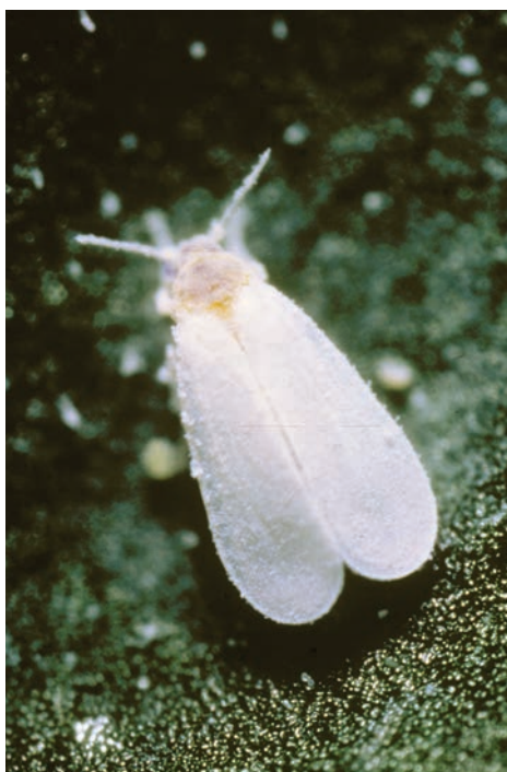
Figure 1. Greenhouse whitefly adult.

The primary whitefly species encountered in greenhouses are the greenhouse whitefly, Trialeurodes vaporariorum , and the sweetpotato whitefly, Bemisia tabaci . Both species are prevalent worldwide and feed on a wide range of ornamental and vegetable plants grown in greenhouses. This publication discusses whitefly identification, biology, plant damage, movement in greenhouses, and provides management strategies that will help alleviate problems with whiteflies in greenhouses.