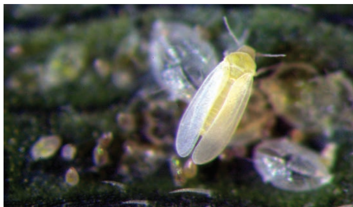
Figure 3. Sweetpotato whitefly adult

The adult sweetpotato whitefly has a light-yellow body with white wings. The wings are retained roof-like over the body at a 45-degree angle (Figure 3). The sweetpotato whitefly pupa is flattened with no parallel sides. In addition, the pupa does not have long waxy filaments around the periphery (Figure 4).