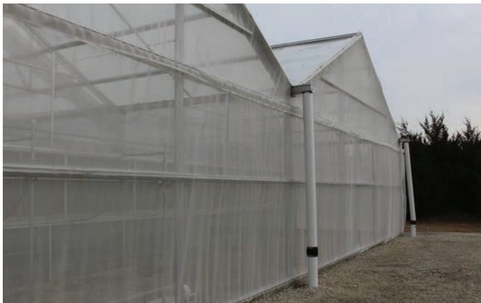
Figure 18. Screening greenhouse openings can exclude adult whiteflies from entering greenhouses.

ventilating the greenhouse to avoid plugging up holes in the screen fabric, which can restrict airflow. Be sure to turn off all fans in the evening after ventilation before cleaning screens.