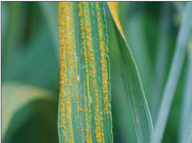
Figure 1. Symptoms of stripe rust on wheat.