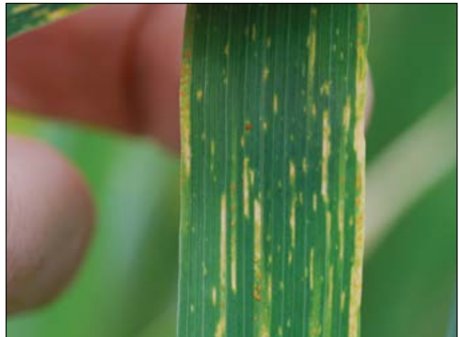
Figure 2. Symptoms of stripe rust vary among varieties. Moderately resistant varieties often have tan colored lesions.