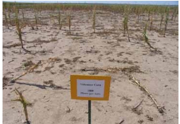
Figure 2. Image of 1,000 volunteer corn plants/a.