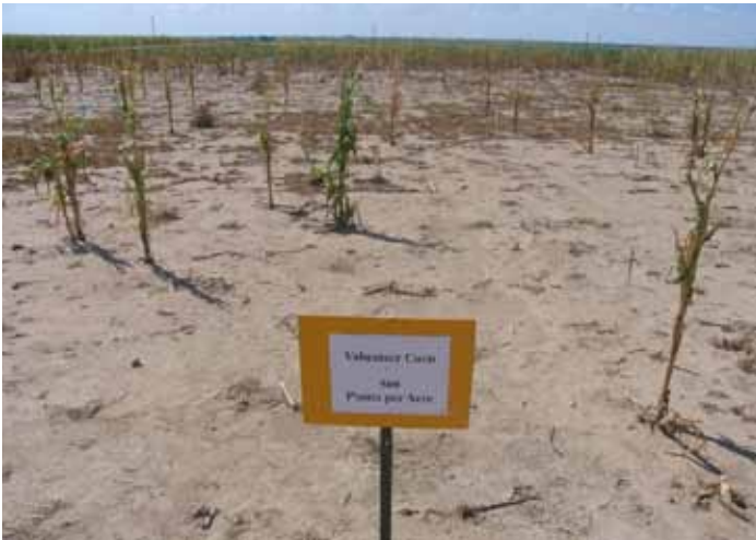
Figure 1. Image of 500 volunteer corn plants/a.