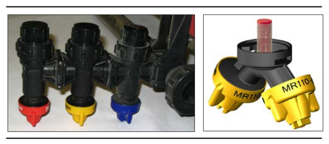
Figure 3. Wilger combination nozzle bank (left) and Twin Cap adapter with MR nozzles.

Another option with promise is a special nozzle design that incorporates a double flat-fan spray set up. Double cap or twin cap nozzle holders are available from manufactures to adapt standard nozzle bodies. This design has two cap openings or two independent caps allowing for two flat-fan nozzles to be mounted on the typical nozzle body (figure 2). One nozzle is oriented forward and one backward from the direction of travel, ranging from 60 to 120 degrees between. This arrangement should not be confused with twin-orifice nozzles. A double cap setup could accommodate either extended range or turbo flat-fan designs (figure 4) or a combination as long as flow rate and droplet size needs were fulfilled. It is also possible to use this 'TwinFan' arrangement in combination with the Greenleaf AirMix® and TurboDrop® Venturi (TDTF) (figure 4). Greenleaf is recommending a smaller orifice with wider angle to produce smaller droplets