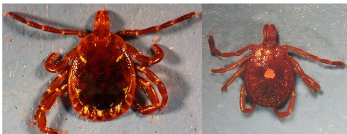
Figure 3. Adult lone star tick ( Amblyomma americanum ) male (L) and female (R).

While the lone star tick is considered a major nuisance parasite, it is also a vector of Ehrlichia chaffeensis (human monocytic ehrlichiosis) and Borrelia lonestari , which causes a Lyme disease-like infection called southern tick-associated rash illness. This tick has also been implicated in the transmission of Francisella tularensis (tularemia), Heartland virus, and Bourbon virus. Bourbon virus was discovered in Bourbon County, Kansas in 2014. This tick is also commonly associated with alpha-gal syndrome, known as the red meat allergy.