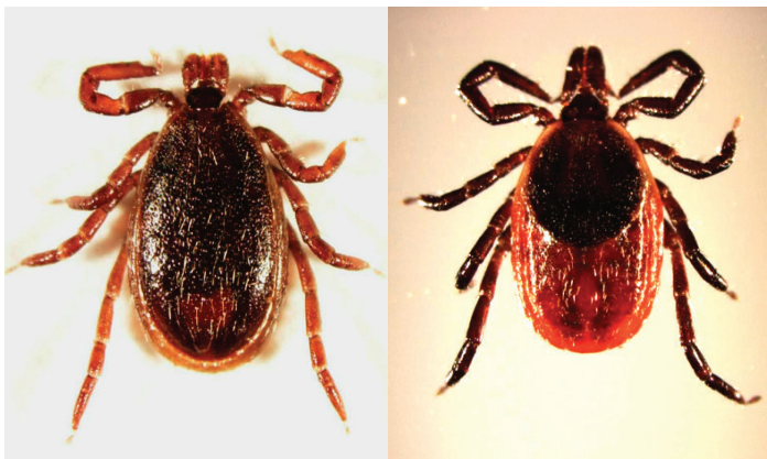
Figure 7. Adult Black-legged tick ( Ixodes scapularis ) male (L) and female (R).