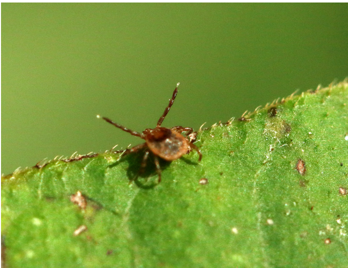
Figure 1. Adult tick showing questing behavior.

The tick species that most commonly infest people and domestic animals in Kansas are Amblyomma americanum (lone star tick), Dermacentor variabilis (American dog tick), Dermacentor albipictus (winter tick), Ixodes scapularis (blacklegged tick or deer tick) and Rhipicephalus sanguineus (brown dog tick).