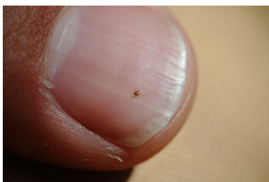
Figure 4. Larval lone star tick ( Amblyomma americanum ) on adult fingernail.