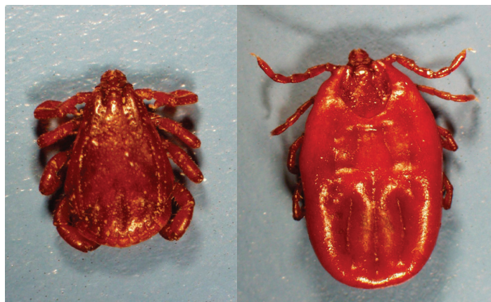
Figure 6. Adult brown dog tick ( Rhipicephalus sanguineus ) male (L) and female (R).

It is the only species of tick that infests human dwellings and kennels in North America and the entire life cycle can be completed indoors. Infestations can occur in heated buildings any time of the year. These ticks often crawl into the ceilings and into cracks and crevices along floors to molt or lay eggs. Infestations of homes or kennels are distressing to pet owners and are extremely difficult to eradicate. Infestations in kennels may be associated with outbreaks of Ehrlichia canis (canine ehrlichiosis) and Babesia canis .