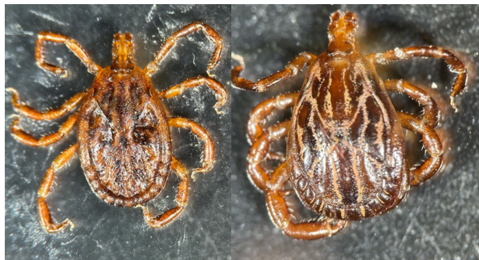
Figure 5. Adult Gulf Coast tick ( Amblyomma maculatum ) male (L) and female (R).

Although not as common, the closely related Gulf Coast tick, Amblyomma maculatum (Figure 5) can be found feeding on the ears of cattle causing an inward turning and scarring called gotch ear. It is also a vector for Hepatozoon americanum , the etiologic agent of American canine hepatozoonosis. The transmission of this pathogen is unclear, but it is thought dogs need to ingest the tick to become infected.