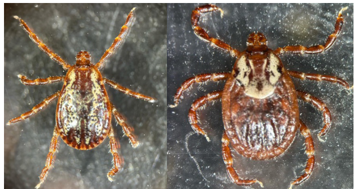
Figure 2. Adult American dog tick ( Dermacentor variabilis ) male (L) and female (R).

American dog ticks can transmit Rocky Mountain spotted fever ( Rickettsia rickettsii ) to dogs, cats, and humans. They can also transmit cytauxzoonosis ( Cytauxzoon felis ) — an often-fatal blood parasite to cats. The American dog tick can also induce tick paralysis, which is caused by components in tick saliva. Tick paralysis occurs more frequently in children and smaller animals and can often be reversed by removing the tick in a timely manner.