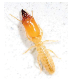
Figure 3 - Soldier

Workers are creamy-white, soft-bodied, wingless, eyeless insects and are most numerous in the colony (Figure 2). They do all of the “work” such as getting food, feeding soldiers and reproductives, and building tunnels. Workers feed on the soft grain of the wood, which may result in structural damage.