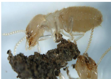
Figure 2 - Worker

Winged termites are commonly mistaken for winged ants. It is easy to distinguish between the two (Figure 1). Winged termites or “swarmers” have straight antennae, thick “waists,” and four long, fragile wings of equal size. Winged ants have elbowed (bent) antennae, narrow waists and two forewings that are larger than the two rear wings.