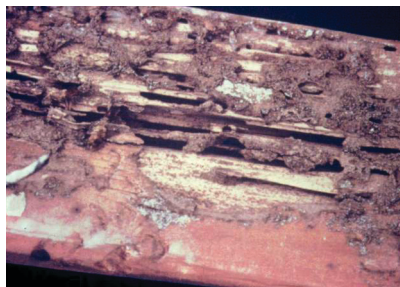
Figure 6 – Mud-filled joints in wood