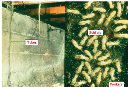
Figure 5 – Termites and Termite Tubes