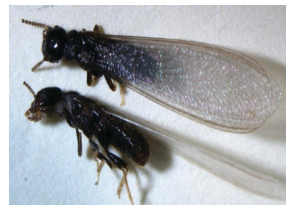
Figure 4 - Reproductives

The following are signs a structure may have a termite infestation: