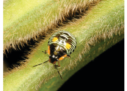
Figure 3 – Green stink bug nymph

All five instars of the brown stink bug are yellow to tan. They have a brown pronotum and brown spots down the middle of the abdomen. Adults are \frac{1}{2} to \frac{5}{8} inch long and are dull brown to yellow (Figure 6). Eggs are kettle-shaped and white. Brown stink bugs are widely distributed but not as common as the green stink bug in Kansas.