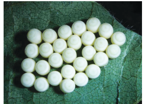
Figure 4 – Green stink bug eggs