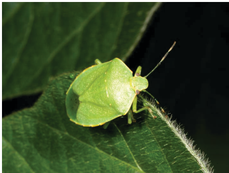
Figure 1 – Adult green stink bug

Stink bugs belong to the order Hemiptera (family Pentatomidae). Both nymphs and adults use piercing-sucking mouthparts to puncture plant tissue and suck out fluids. They feed anywhere they can penetrate tissue but prefer young, tender, more succulent plant parts or developing seeds. The stink bug life cycle consists of barrel-shaped eggs, five nymphal stages (instars), and the adult stage. Green and brown stink bugs behave similarly but can be identified in all nymphal stages by their physical characteristics.