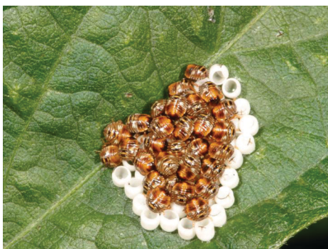
Figure 2 – First instar green stink bug nymphs

Green stink bug (Figure 1). First instar nymphs are reddish brown and tend to remain clustered on the egg mass unless disturbed. They do not appear to feed on plant tissue (Figure 2). Second and third instars are pale to dull green with black and white stripes on the dorsal surface of the abdomen (Figure 3). Second-instars also remain near the egg mass but begin to feed on plant tissue, especially around tender shoots and reproductive