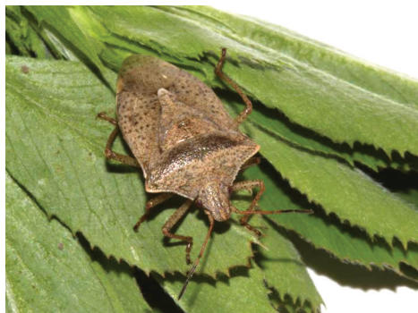
Figure 6 – Adult brown stink bug