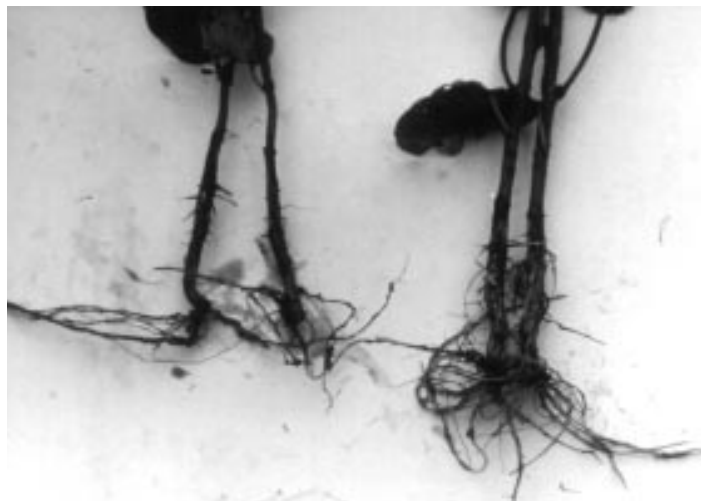
Malformed roots (left) indicate a compaction problem.

Tillage pan — Tillage implements that shear the soil, such as moldboard plows, disks, and sweep-type tools, have a tendency to cause soil compaction. When continuously operated at the same depth, tillage implements orient soil particles in the same direction, creating a layer of compacted soil. This compaction is typically referred to as a tillage or plow pan. The potential to cause a tillage pan is greater under wet soil conditions than under dry conditions.