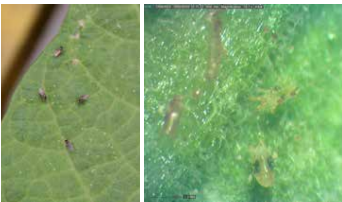
Figures 2 and 3. Leafminer adults (left) and twospotted spider mites (right).