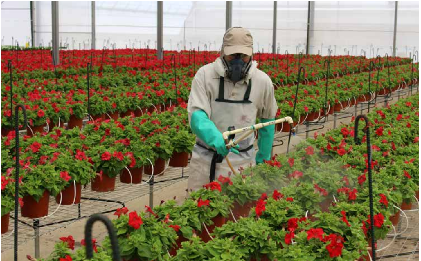
Figure 6. Frequent pesticide applications can result in arthropod pest populations developing resistance.

survive because they are not in susceptible life stages (eggs or pupae) or do not come in contact with spray residues. Any surviving individuals that may be resistant can then breed with other resistant survivors to produce a population of highly resistant individuals that eventually become fully resistant to the pesticide after nearly all susceptible individuals in the population are killed.