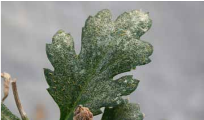
Figure 1. Western flower thrips.

Each successive pesticide application places additional selection pressure on arthropod pest populations, which may further increase the frequency of resistant individuals (Figure 5). Pesticide resistance develops in arthropod pest populations through one of two mechanisms, either metabolic detoxification or physiological changes. Metabolic resistance is the breakdown of the pesticide active ingredient inside the insect body. The metabolic process is triggered by specific enzymes that detoxify or convert the active ingredient into a nontoxic form before the active ingredient is excreted with waste from the body. Physiological resistance involves alterations in the site targeted by the