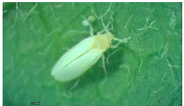
Figure 4. Sweetpotato whitefly adult.