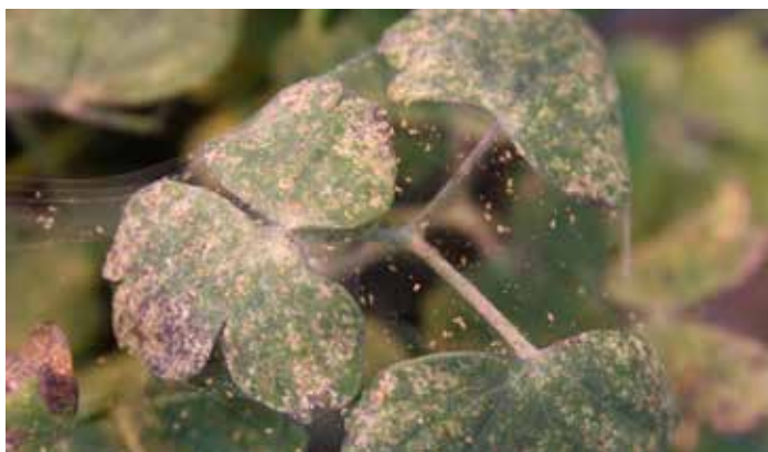
Figure 7. Localized or isolated populations of arthropod pest populations can develop resistance to pesticides.

Arthropod pests such as the twospotted spider mite (Figure 7) that remain on plants to feed may develop resistance faster than thrips and whiteflies, which are more mobile. Resistance develops rapidly because the intense selection pressure associated with frequent pesticide applications reduces the number of susceptible individuals