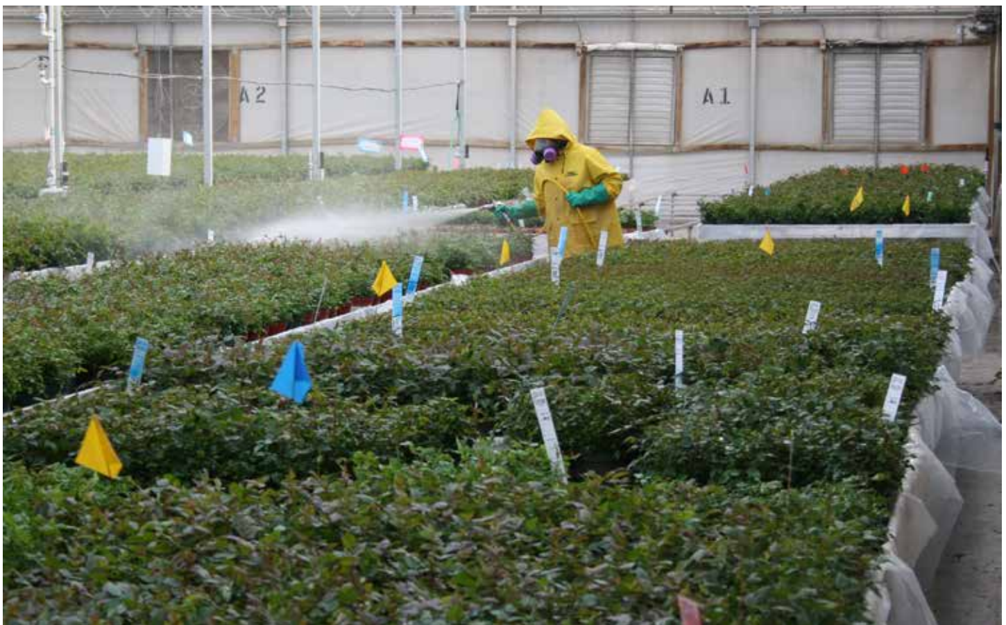
Figure 5. Every time a pesticide is applied selection pressure is placed on arthropod pest populations.

Many arthropod pests encountered in greenhouse production systems have short life cycles (egg to adult) and females have high reproductive rates, both of which contribute to the increased likelihood of resistance developing in arthropod pest populations. Furthermore, in greenhouse production systems arthropod pests can breed year-around with many generations occurring simultaneously, which may warrant more frequent pesticide applications. In general, most pesticides are applied every 5 to 7 days. Despite frequent applications, a certain number of individuals may