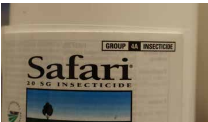
Figure 8. Pesticide products contain information about the mode of action based on the IRAC group designation.

It is still unclear if pesticide mixtures are more effective than other application methods in delaying the onset of resistance. Greenhouse producers may wrongly assume that two or more pesticides applied at different intervals offer the same advantage as a pesticide mixture. The assumption is incorrect because each individual arthropod pest in a population has not been exposed to a lethal dose or concentration of each pesticide. In fact, resistance may evolve more rapidly than would occur with a pesticide mixture.