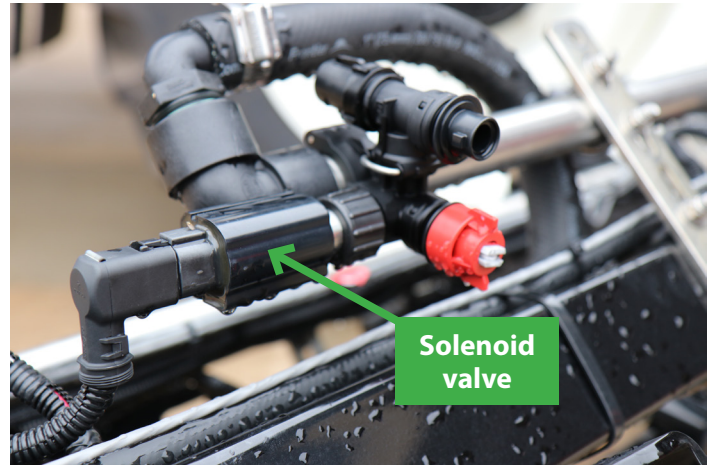
Figure 1. Solenoid valve mounted on the nozzle body to apply the product based on PWM

One of the technologies currently implemented in agricultural sprayers is Pulse Width Modulation (PWM). In this system, flow is varied by pulsing an electronically actuated solenoid valve that is directly situated before the nozzle by changing the duty cycle (Figure 1) during speed transition, while the system, presumably, tries to maintain target application pressure at all times. Flow control actuation at the solenoid level maintains full pressure in the booms when the solenoid valves are in the OFF state, and can rapidly provide target pressure with fully developed spray fan patterns when the system cycles back to the ON state.