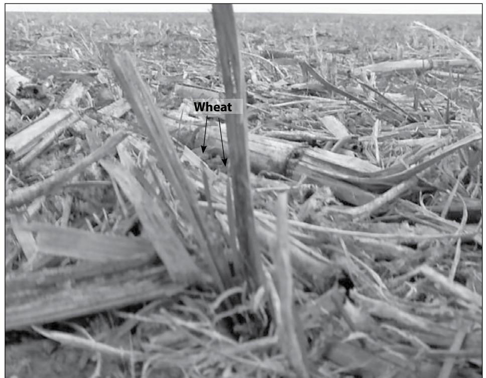
Figure 2. A wheat plant growing in an open seed slot closure with a corn leaf hair-pinned underneath it.