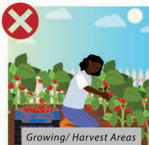
Growing/ Harvest Areas

Sick farm workers cannot go into areas on the farm where fresh produce is grown, harvested, washed, packed, or stored .