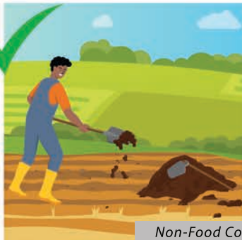
Non-Food Contact Activities

Farm workers who are sick and come to the farm must avoid working with fresh produce or food contact surfaces .