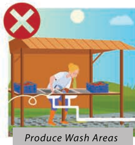
Produce Wash Areas