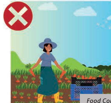
Food Contact Activities