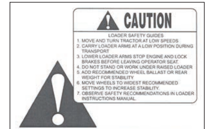
Figure 1. Typical safety sign for front-end loaders.