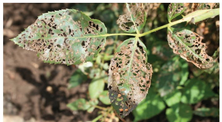
Figure 10. Japanese beetle adult feeding damage on rose leaf.