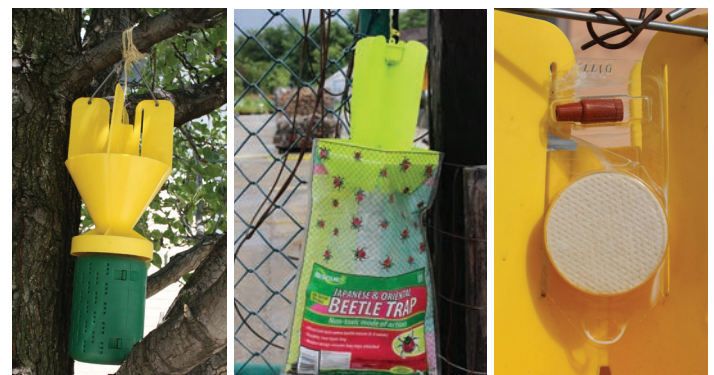
Figure 13. Japanese beetle adult traps (left and center). Figure 14. Floral food lure (bottom right) and synthetically-derived sex pheromone (top right).