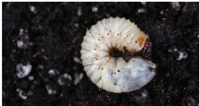
Figure 5. Japanese beetle third-instar larva or grub.

Japanese beetle larvae have a distinct rastral (setae) pattern on the end of the last abdominal segment consisting of two rows of short spines in a V-shape surrounded by a random arrangement of spines (Figure 6). When the soil is moist early in the summer, larvae are located near the soil surface. However, as soil dries, larvae migrate deeper into the soil. They eventually move upward and resume feeding when the soil is moist. In late fall, larvae migrate down deeper into the soil when soil temperatures are below 60°F (15°C). As soil temperatures increase in the spring, larvae move closer to the surface and begin feeding on the roots of turfgrass and other plants. In late spring, larvae create a cavity