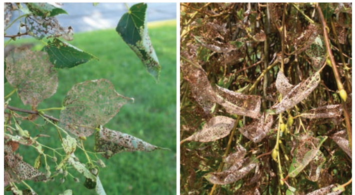
Figures 11 and 12. Japanese beetle adult feeding damage on littleleaf linden leaves (left) and pussy willow (right).

Population management should begin after larvae emerge from eggs when they are small and near the soil surface. A number of soil-applied insecticides are available for managing Japanese beetle larval populations. Many products should be applied four weeks before larvae emerge from eggs to ensure insecticide residues are present in the soil when larvae are small. Larger larvae can be difficult to kill with most soil-applied insecticides, thus requiring treatment with trichlorfon (Dylox). Soil-applied insecticides become less effective as larvae migrate deeper into the soil to overwinter.