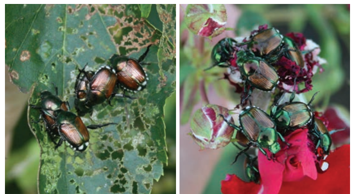
Figures 8 and 9. Japanese beetle adults feeding on linden leaf (left) and rose flower (right).

Japanese beetle adults feed on more than 300 plants. These include rose, linden, crabapple, willow, Virginia creeper, purpleleaf plum, Norway maple, and American elm. Table 1 lists the ornamental plants that are susceptible to Japanese beetle adults. Adult beetles congregate on leaves and flowers (Figures 8 and 9) and mainly feed on the upper leaf surface, creating irregularly shaped holes (Figure 10). On highly susceptible plants, Japanese beetle adults will feed on the leaf tissue between the veins, which results in