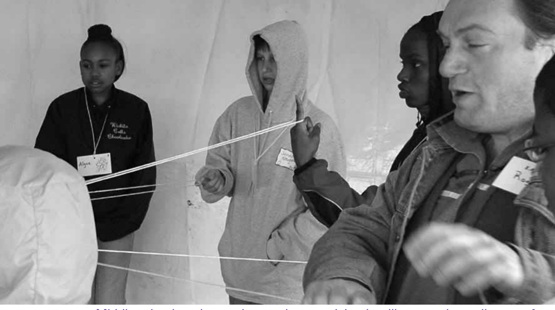
Middle-school students take part in an activity that illustrates how all parts of nature are dependent on each other for a balanced ecosystem.

provided by an EPA-Section 319 nonpoint source pollution control grant through the Kansas Department of Health and Environment Water Management Section in cooperation with K-State Research and Extension and the Kansas Center for Agriculture Resources and the Environment.