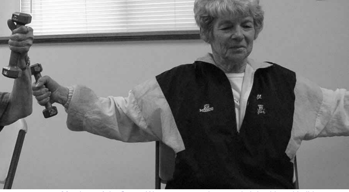
Members of the Strong Women program improve their health and build friendships through twice-weekly exercise sessions.

importantly feel better about themselves."