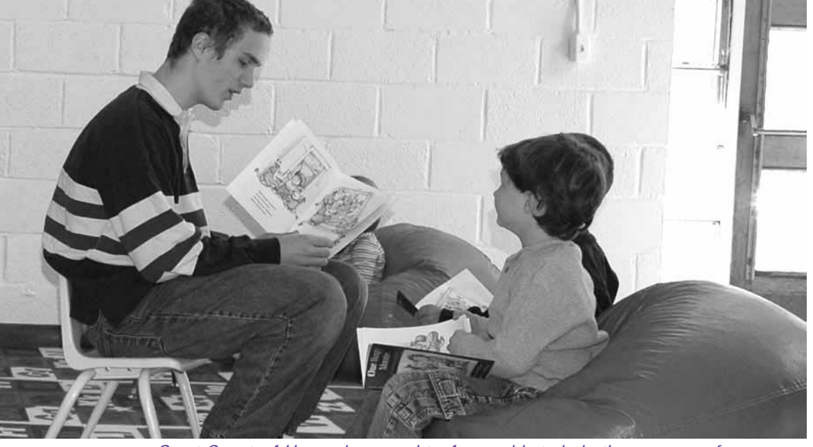
Grant County 4-H members read to 4-year-olds to help them prepare for school. The 4-H'ers applied for grant funds to purchase the books.