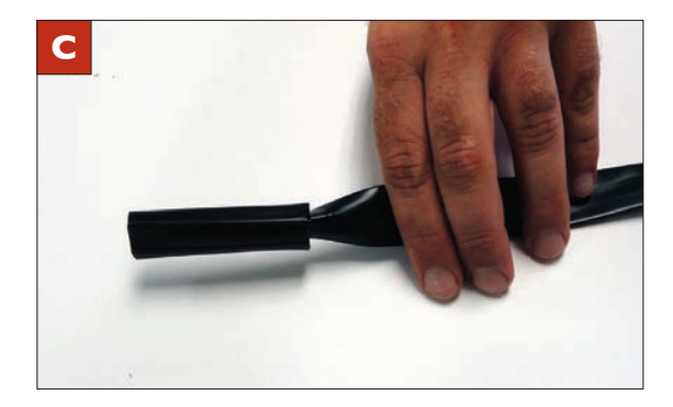
Figure 10. ( A ) The drip tape is folded three times and held securely. Crease and bend the folded end lengthwise to make it easier to place the sleeve over the end. ( B ) Slide the sleeve (about a 2-inch piece of drip tape) over the end until it completely covers the end ( C ), which prevents it from unfolding when pressurized.