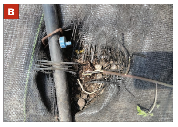
Figure 4. In high-pressure drip systems, emitters are either (A) preinstalled at the factory or (B) installed during assembly.