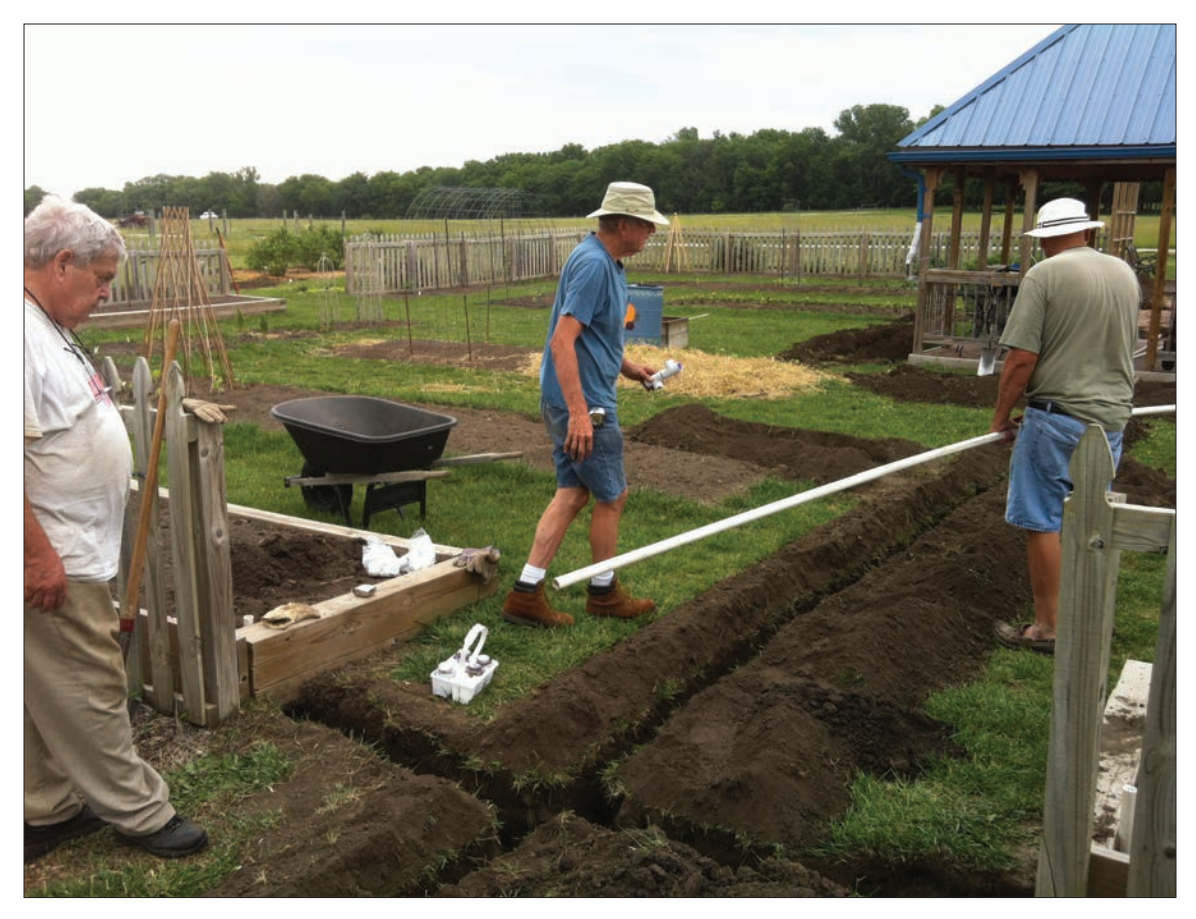
Figure 6. Distribution piping is installed belowground to move water to each bed where header pipes are installed.