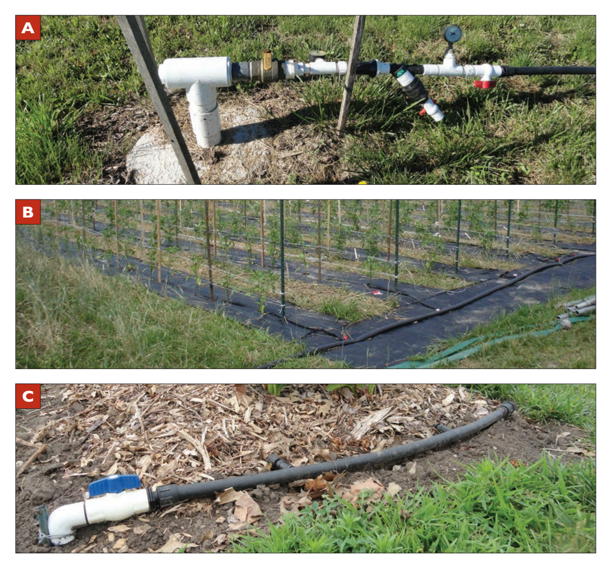
Figure 7. ( A ) Header pipe (left to right) with 1-inch pressure regulator, screen filter, pressure gauge, and valve connect to 1-inch poly piping. ( B ) Header pipe runs perpendicular to rows and distributes water to drip tape in a low-pressure drip system. Fabric mulch can be used to reduce weeds and grass growth under the header pipe. ( C ) Small/short header pipe is shown in a high-pressure system with a valve from underground piping.

To terminate the line (low-pressure systems), fold the end of the drip tape three times and slide a small section of drip