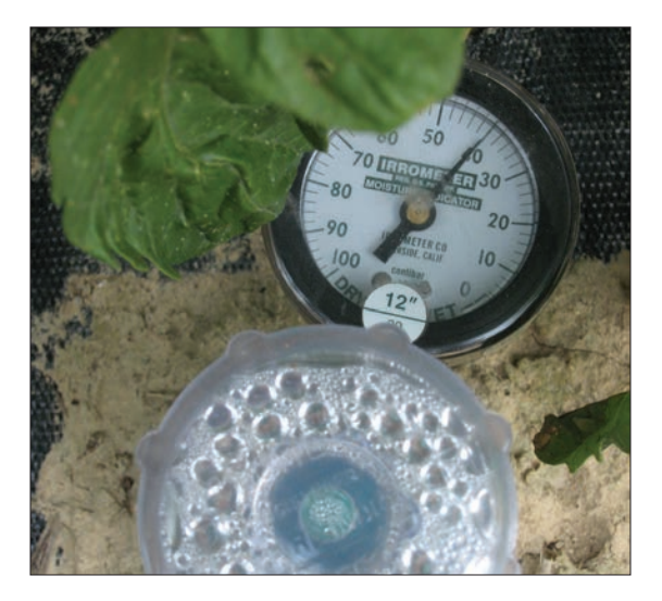
Figure 11. A tensiometer can be used to monitor soil moisture.