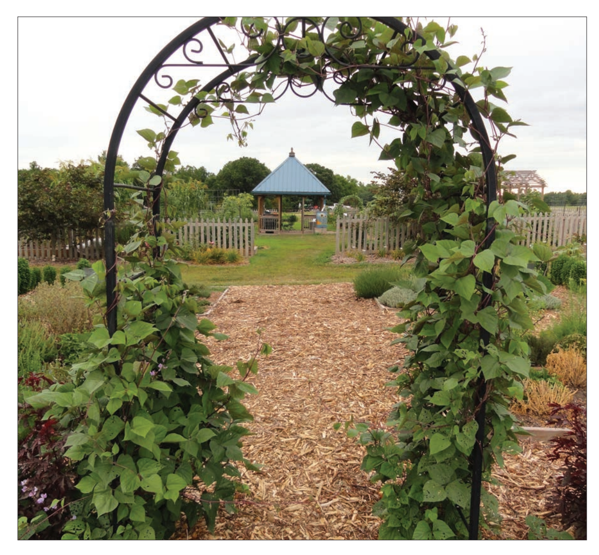
Figure 2. A communal-type community garden in Olathe, Kansas.

A disadvantage of drip irrigation is that filtration is required to keep particles from clogging emitters. Maintenance of lowpressure (drip tape) systems can be relatively high, and rodents, mowers, and weed trimmers can cause damage. Drip systems must be monitored for leaks and checked regularly to make sure they are functioning properly.