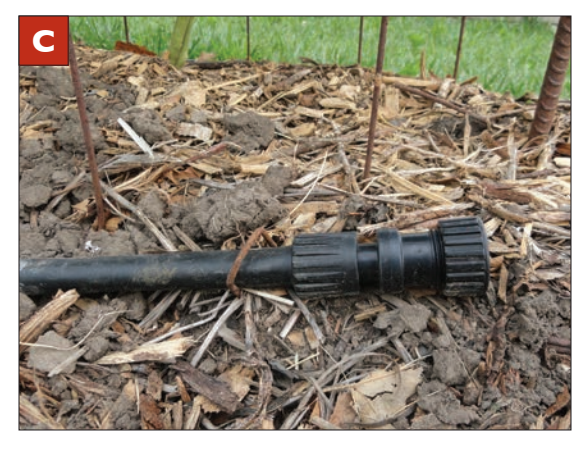
Figure 9. (A) A simple system for unrolling drip tape that can be used by a single installer. (B) Drip tape is connected to the header pipe with PVC connectors that have reverse-threaded locking collars. (C) Drip tubing is terminated with a premanufactured cap.

electric solenoid valves in automatic watering systems. Manually check automatic irrigation systems and soil conditions to assure proper operation. Soil moisture also can be estimated by hand, pressing soil together and observing its "stickiness" and its ability to "clump" together.