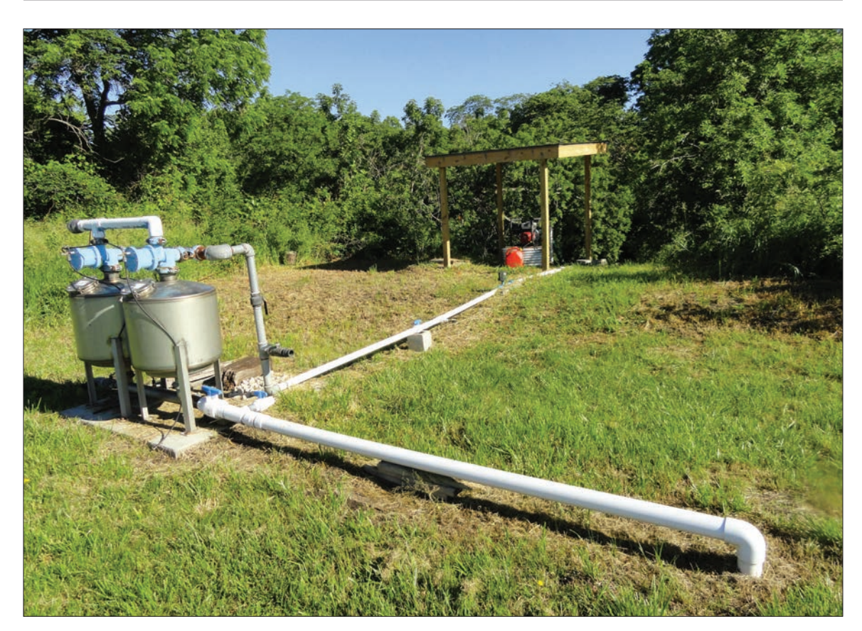
Figure 5. A sand filter (foreground) is used to filter creek water that is pumped with a gas-powered pump (background).