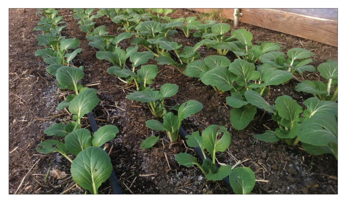
Figure 1. Drip tape running alongside pak choi provides water directly to the root zone.

Drip (trickle) irrigation was invented in England in the 1940s and has continued to grow in popularity. In addition to conserving water, drip irrigation benefits the plant by providing consistent soil moisture. Drip systems deliver water with precision, which reduces weed growth between rows and limits the spread of plant pathogens. It also allows for fertigation, the injection of fertilizers into irrigation water.