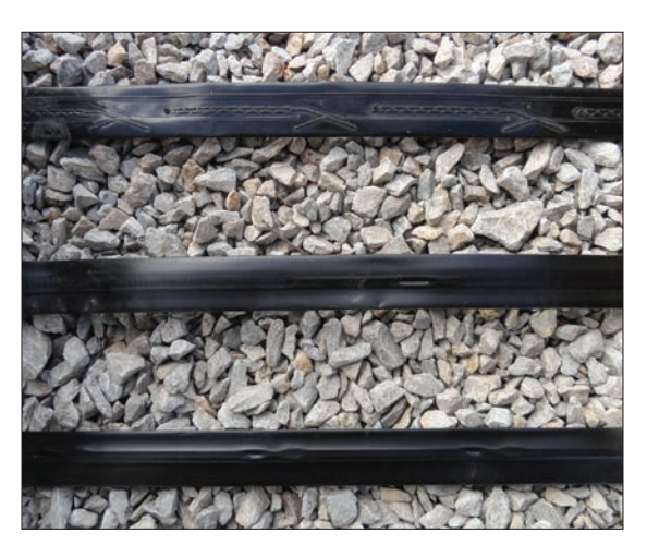
Figure 3. Drip tape is commonly used in larger garden plots and communal gardens. Built-in emitters are available at various spacings.

When purchasing drip tape and/or pressure regulators, select the correct pressure regulator for the drip tape to ensure accurate operation. One advantage of drip tape is that it can be installed in long rows (>500 feet), and the same amount of water is delivered throughout the entire run. Drip tape can be reused for 1 to 2 years if stored in a rodent-free environment. Drip tape is connected into header (distribution) lines with simple connectors and terminated by making an end cap.