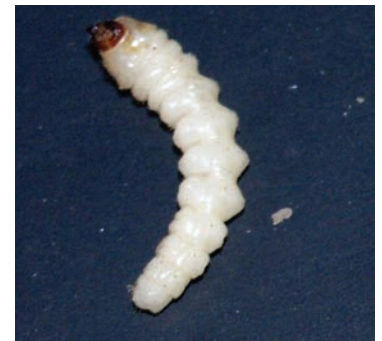
Figure 4. Mature larva from sunflower