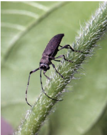
Figure 1. Adult Dectes texanus