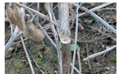
Figure 7. Girdled soybean stem