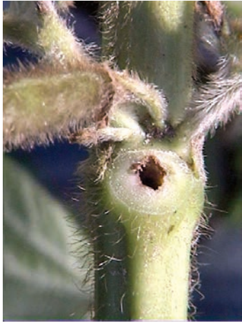
Figure 8. Detached petiole where stem borer entered stem

Newly hatched larvae spend the first larval stage (instar) in the leaf petiole and then tunnel down into the main stalk where they feed selectively on the pith in the central core. In soybeans, infested leaves die, and entrance holes into the main stalk are visible when they are removed (Figure 8). A single female may lay a number of eggs in the same