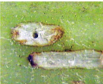
Figure 2. Adult feeding scar and ovipuncture on sunflower petiole

Adult beetles are gray to bluish-gray and \frac{3}{8} to \frac{3}{4} inches (1.0 to 2.0 cm) long (Figure 1). Antennae have dark, transverse bands and are longer than the body. Adult beetles are active during the day but secretive, spending much of the time hiding under leaves within the plant canopy. Sometimes they may be seen flying and running around on plant surfaces. When approached, beetles either take flight or fall to the ground, feigning death.