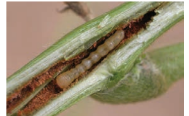
Figure 5. Larva in soybean petiole