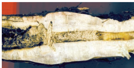
Figure 9. Mature dectes larva in confection sunflower showing limit of girdling radius

Another advantage of large plants is slower stalk desiccation postmaturity, which may extend the period of larval feeding and delay girdling. In oil sunflowers, yield per