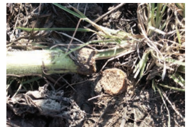
Figure 6. Girdled sunflower stalk