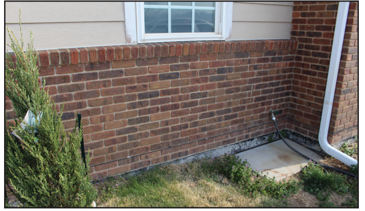
Figure 4. Apply pesticides to the foundation up to the bottom of windows (Raymond Cloyd)