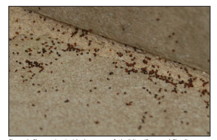
Figure 2. Clover mites inside the corner of a building (Raymond Cloyd)