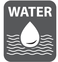
W-6 Total Coliform and E. coli Bacteria

Store unopened Petrifilm plate pouches at temperatures below 46° F. Allow pouches to come to room temperature before opening. Return unused plates to the pouch. Prevent exposure to moisture after opening pouches. Store resealed pouches in a cool dry place for no longer than one month. Exposure of plates to temperatures above 77° F and/or humidities above 50 percent can affect performance of the plates. Do not use plates that show orange or brown discoloration. Expiration date and lot number are noted on each package of Petrifilm plates. After use, Petrifilm EC plates will contain viable bacteria. Put all used Petrifilm in a plastic bag, inside another plastic bag, and take to sanitary landfill or transfer station. Alternatively, mix a mild chlorine bleach solution (10 percent) and put one dropper full on each exposed plate to kill the bacteria before disposal.