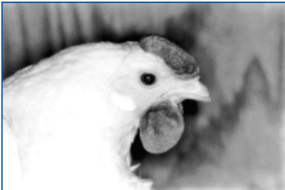
Figure 3. A 45-week-old layer trimmed at 7 days of age using the medium trim method shows some regrowth of the beak without the sharp downward ‘hook’ which often leads to increased injury.