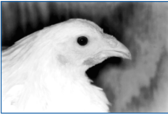
Figure 1. A 12-week-old egg production pullet with an untrimmed beak. Notice the length and downward ‘hook’ of the beak that could easily harm other birds.