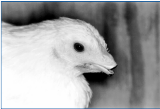
Figure 2. A 12-week-old pullet that has been properly trimmed using the late, heavy trim method will be less prone to cannibalism and is able to perform as well as untrimmed birds.