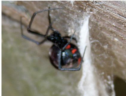
Northern black widow ventral (bottom) view

Three species of black widow spiders can be found in Kansas: the northern, Latrodectus variolus , the southern, L. mactans , and the western, L. hesperus . These three species differ somewhat in appearance but are similar in biology and behavior.