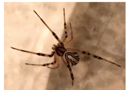
Immature black widow spider dorsal (top) view

Male and immature widow spiders do not produce the same toxic venom as female spiders, but young spiderlings carry a toxic substance in their bodies that may harm pets or children if swallowed. Male black widows are typically half or less the size of the mature female and brown to light black in color. The male may or may not have the hourglass figure on the underside of the abdomen, but the top, or dorsal side,