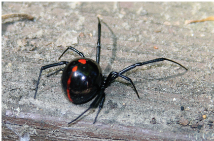
Northern black widow dorsal (top) view