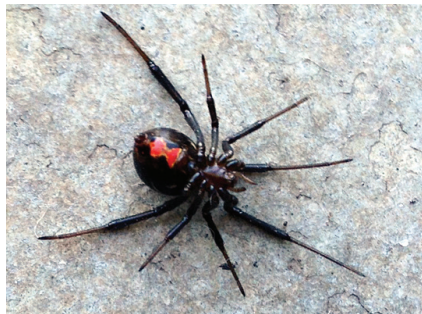
Southern black widow ventral (bottom) view