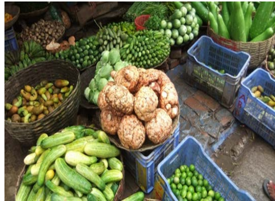
Vegetables in open market at Karwan Bazaar.

The wet markets are generally crowded, unorganized, and there are piles of trash in every nook and corner. Proper drainage and cleanliness is a problem in these open markets.