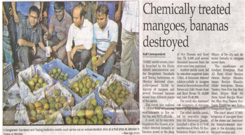
A Bangladesh Standards and Testing Institution mobile court carrying out an anti-adulteration drive

According to Dr. Mahoney, Chief Technical Advisor of FAO to National Food Safety Project in Bangladesh, food safety management in Bangladesh is poorly developed and lacks cohesive food safety policy. Present food laws and rules are outdated and incomplete. The inspection system is poorly coordinated, lacks supervision, and is poorly equipped with a limited number of trained staff. A central analytical testing facility is lacking and the test facilities have few trained analysts and no standard testing procedures. Educational and outreach materials focusing on preventative approaches are also lacking.