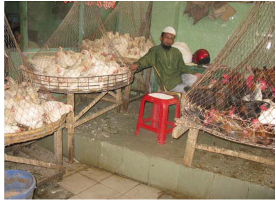
A retail chicken market at New Market Dhaka, Bangladesh

Virus) were reported from the Tejgaon market, but no fatalities occurred. Dr. Yamage stated that the payment of compensations to producers stopped which may have decreased the reports of avian flu cases. Sick birds are probably coming to the market and the H5N1 is spreading unnoticed. Poultry handlers and retail sellers may be becoming symptomless carriers. Dr. Yamage opined that the unsold birds should not be held or returned but slaughtered. The authorities have successfully implemented a day of closure of the wholesale market at Kaptan Bazaar for cleaning purposes. It is expected that similar success will also be achieved soon for the New Market wholesale market. The US Agency for International Development (USAID) has helped in the process of observing cleanliness and sanitary practices by providing Virkon-S livestock disinfectants, gloves, and aprons. The FAO project also is helping to improve the drainage system of both Kaptan Bazaar and New Market wholesale poultry markets.