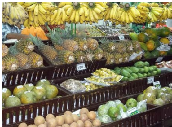
Fruits on display in Agora super market.

The indoor super market in Gulshan, Dhaka, is near to the foreign diplomat area and is clean and neatly organized. The company, Agora, has opened branch markets in other upscale neighborhoods of Dhaka. It was observed that there is an abundance of produce from Western countries to cater to the demand of middle and upper class consumers. This may partly be due to non-availability of local finished products or because of growing concern of adulterated or toxic preservative mixed food products that have been found in a variety of locally grown vegetables, fruits, and fish. The unit prices of each product are displayed and there is no need to bargain or haggle. The market authorities claimed that they buy from reputable local sources and also