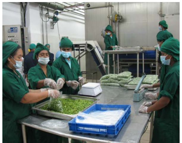
Blanched long bean (Lubea) being packaged and weighed prior to deep freezing at the Golden Harvest agro processing plant in Gazipur, Bangladesh.