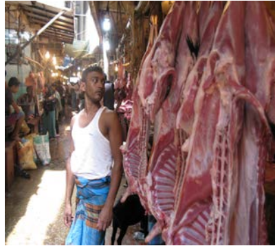
Goat meat stalls at Kaptan Bazaar.

The team visited the wholesale chicken market at Kaptan Bazaar where more than half a million birds are sold every day in the early morning hours. The team also visited the New Market chicken market where a drainage facility for the market stalls is being fixed by a FAO livestock project.