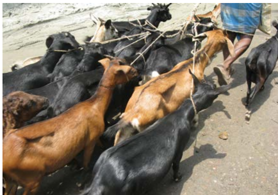
Goats going to the Kaptan Bazaar meat market for slaughter.

Dr. Abdul Baqi, National Consultant and FAO Expert on Bio Security for Live Bird Market, gave a presentation on goat health and the prevalence of Peste des Petits Ruminants (PPR) or goat plague. Goats are important in the rural economy of Bangladesh because raising goats has given economic empowerment to poor women of Bangladesh. The estimated numbers of goats are 21.6 million, as compared to chicken which numbers 221.5 million birds. Black Bengal and Jamunapuri goats are the two predominant varieties in Bangladesh with Black Bengal being most popular. A large number of sheep are raised in rural Bangladesh, as well.