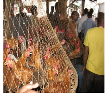
Kaptan Bazaar retail chicken market in Dhaka