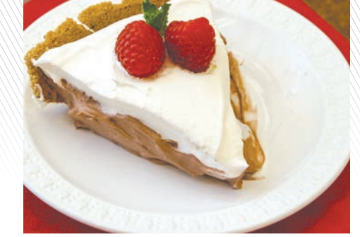
Chocolate Mousse Pie